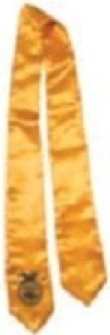
Lone Star FFA Degree MUST HAVE THE State Degree

These items are available to purchase from a LT FFA Advisor