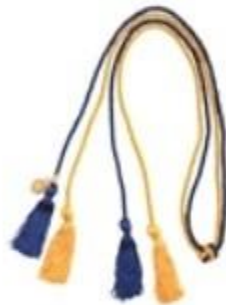
FFA Officer Chord (Must have served as an Officer) $ 15