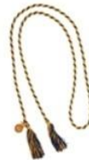
Active Member Recognition Must have; *- Established an approved SAE; or *-Exhibited @ TCYS or Majors; or *-Participated in a CDE & LDE $13